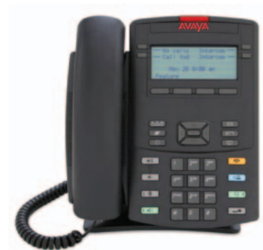
Avaya 1220 IP Deskphone